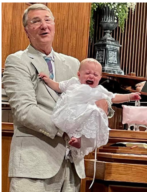
I ❤️ MY JOB!!!

All gatherings take place in the church parlor at 5:30 PM Happy Reading!