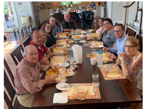
BUMC STAFF TAKING A LUNCH BREAK DURING OUR STAFF RETREAT. PLANNING, COORDINATING, ORGANIZING THE PROGRAMS & SERVICES PROVIDED FOR OUR CHURCH FAMILY BUILDS UP QUITE AN APPETITE!