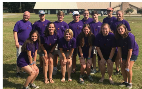
WEEKEND OF THE CROSS 2018